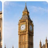
Big Ben (Elizabeth Tower)