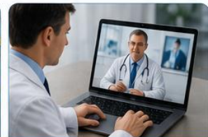
Telemedicine and Remote Care