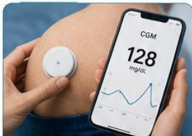
Continuous Glucose Monitoring