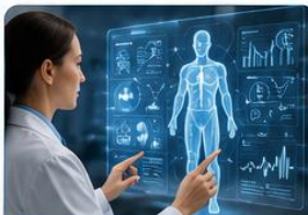
AI in Healthcare