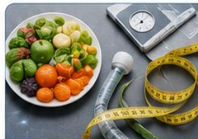
Metabolic Health and Nutrition